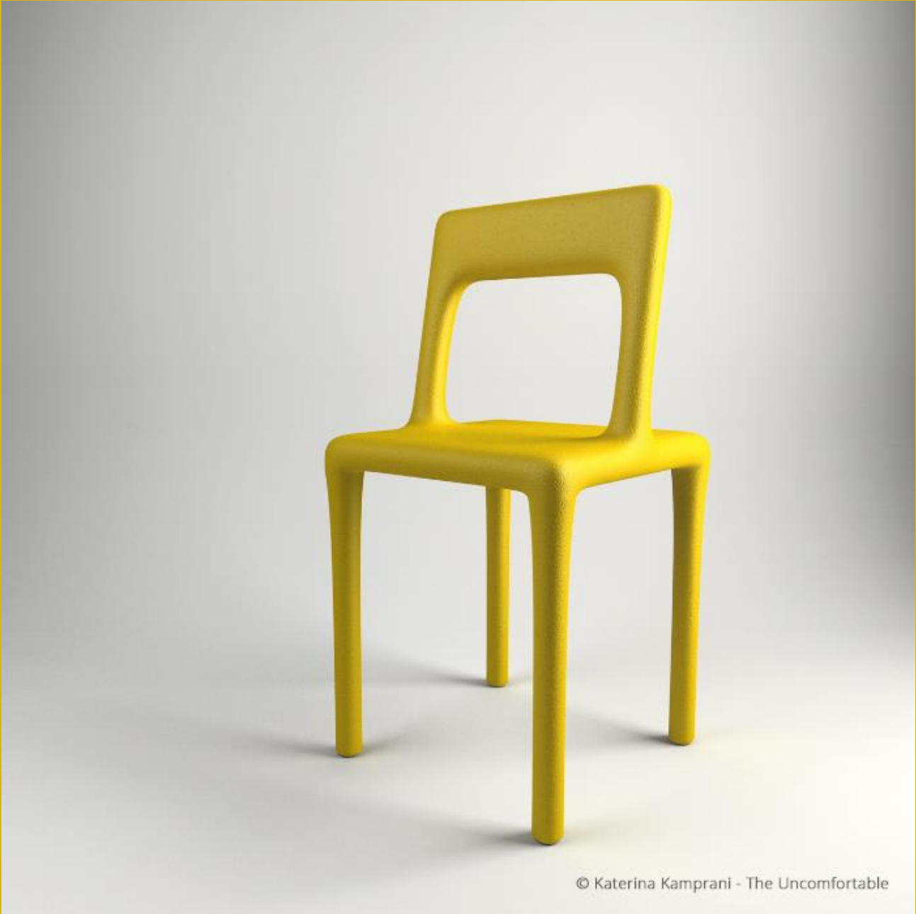
© Katerina Kamprani - The Uncomfortable