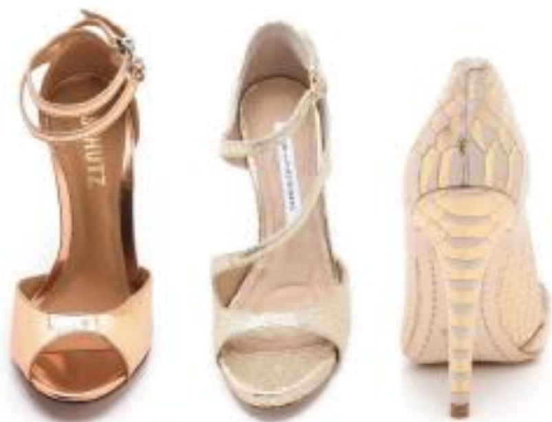
the GOLD SHOES

FOR OUR CREAM & GOLD BRIDAL SHOWER WE FOUND EXQUISITE PIECES TO INSPIRE BOTH THE BRIDE-TO-BE & HER GUESTS OUTFITS